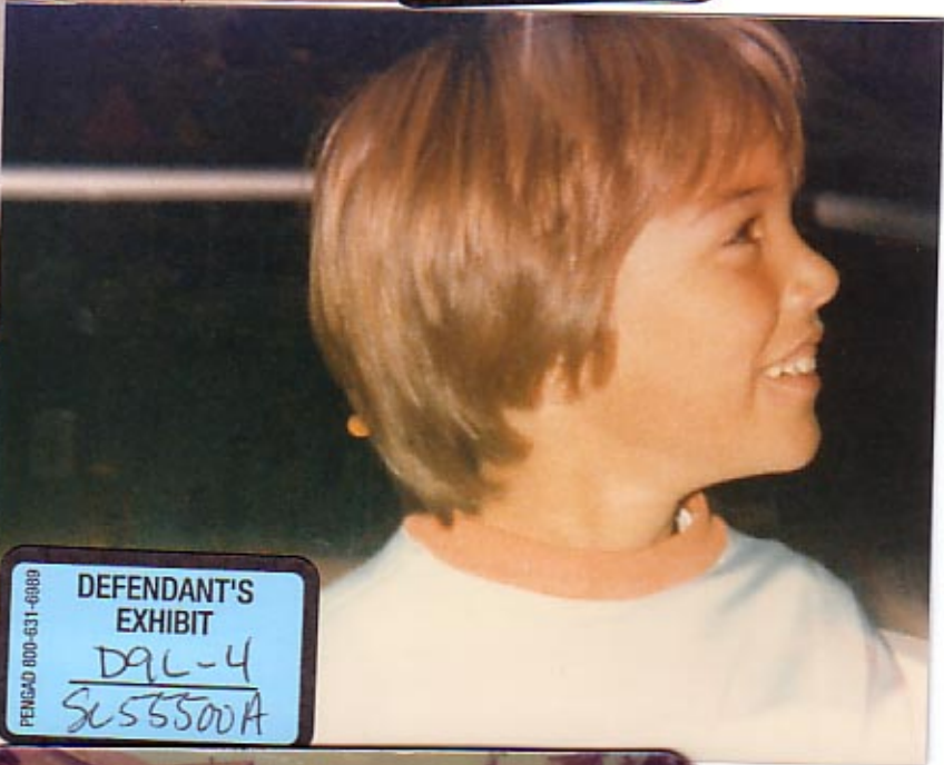
DEFENDANT'S EXHIBIT D9L-4 SC55500A PENGAD 800-631-6889