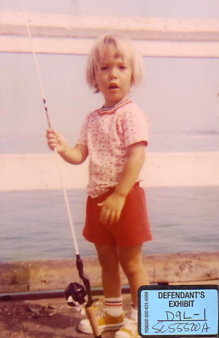
DEFENDANT'S EXHIBIT D9L-1 SC55500A PENGAD 800-631-6889