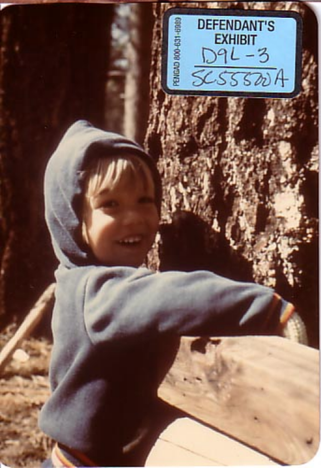
DEFENDANT'S EXHIBIT D9L-3 SC55500A PENGAD 800-631-6889