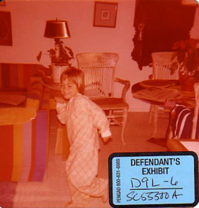
DEFENDANT'S EXHIBIT D9L-6 SC55500A PENGAD 800-631-6889