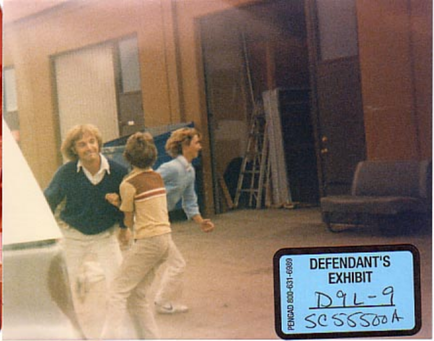
DEFENDANT'S EXHIBIT D9L-9 SC55500A PENGAD 800-631-6889