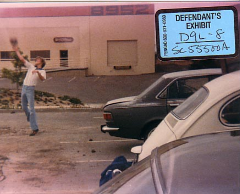
DEFENDANT'S EXHIBIT D9L-8 SC55500A PENGAD 800-631-6889